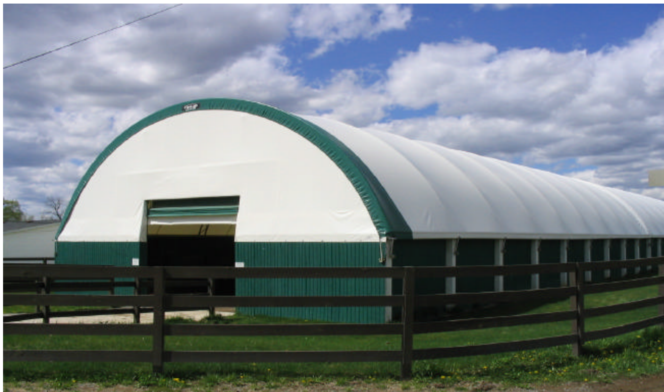
One of the Coverall barns at Bethany Peace Point Equestrian Center