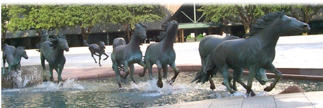
The center's fountain is inspired by and will be reminiscent of the famous Mustangs of Las Colinas, Irving, Texas

A magnificent fountain featuring ten bronze horse sculptures will be installed at the entrance to Bethany Peace Point Equestrian Center. The fountain sponsor will receive naming rights.