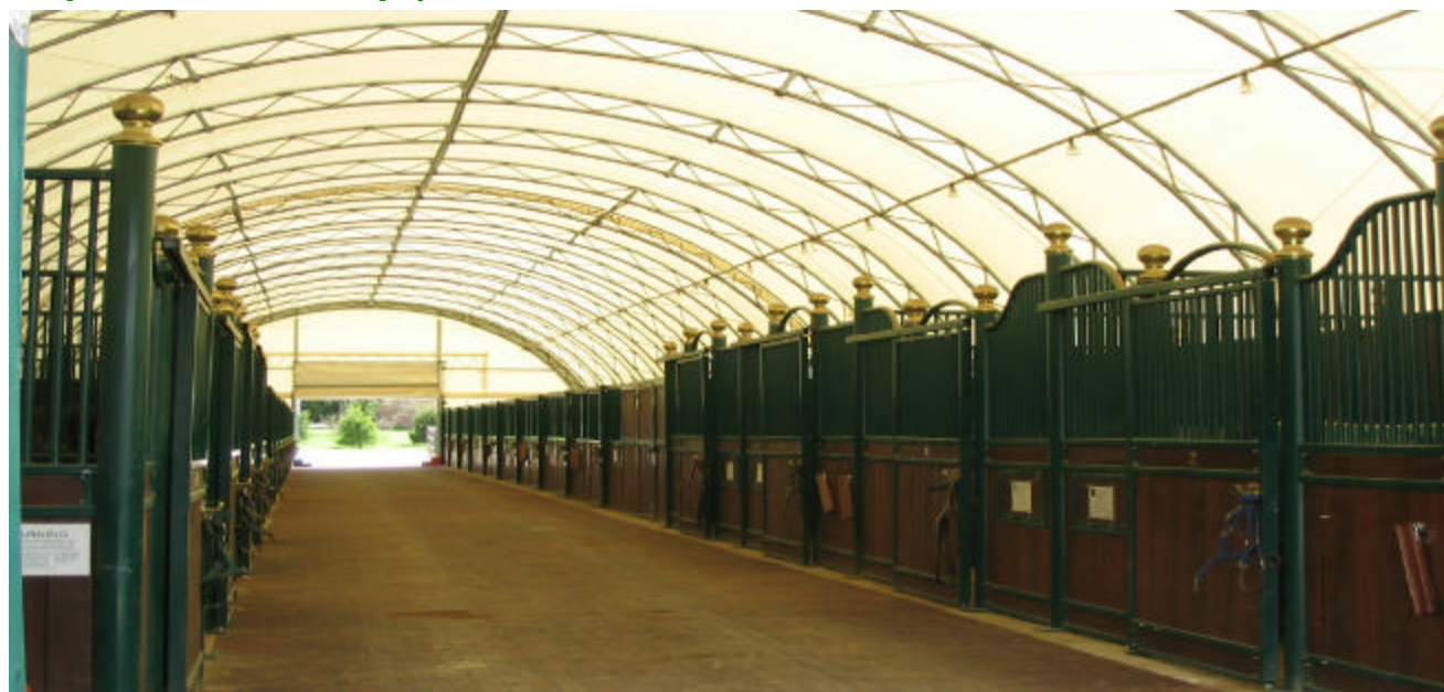
One the barns at Bethany Peace Point Equestrian Center, featuring imported English stalls

The barns at Bethany Peace Point Equestrian Center contain Loddon Supreme stalls imported from England. There will be 150 sponsorship opportunities available for these top quality facilities. For each sponsorship, a plaque bearing the sponsor's name will be displayed on the stall door.