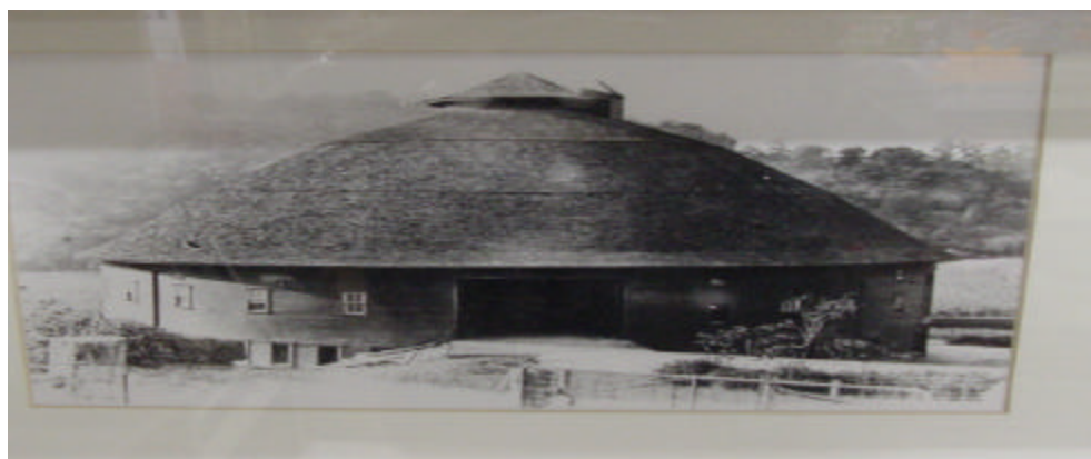
Bethany's historic round barn, photographed in the early 20th century

The round barn, constructed in the early 19th century by Bethany College founder Alexander Campbell, was a Bethany landmark for many years. Over time, however, it fell into disrepair and eventually was dismantled and put into storage. Its foundation remains, situated at the entrance to Bethany Peace Point Equestrian Center and across from the National Historic Landmark Alexander Campbell Mansion. The sponsor of the historic structure's renovation will receive naming rights to the round barn. All onsite signage and publications will identify the round barn by the sponsor's chosen name.